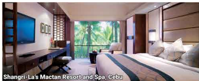
Shangri-La's Mactan Resort and Spa, Cebu