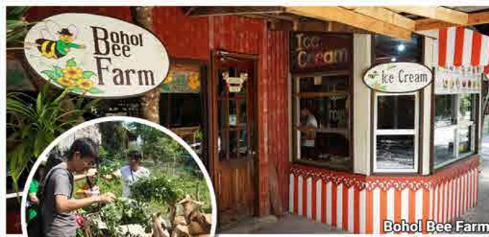
Bohol Bee Farm