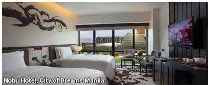
Nobu Hotel, City of Dreams Manila