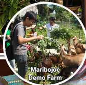
Maribojoc Demo Farm