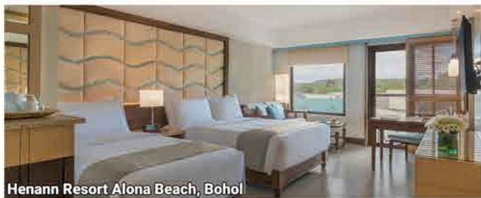
Henann Resort Alona Beach, Bohol