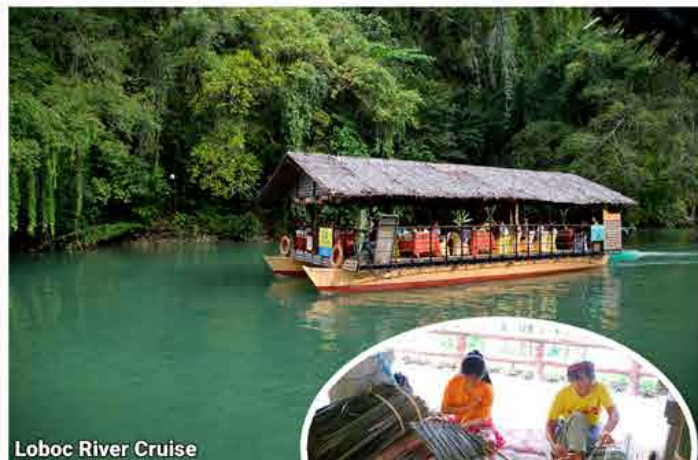
Loboc River Cruise

And in this little paradise, you'll be surprised that nothing is put to waste. Anywhere you look in the area, you would see trash bins where solid wastes are properly segregated. The garbage are then decomposed using the suitable