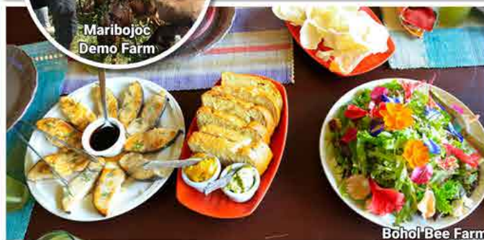
Bohol Bee Farm